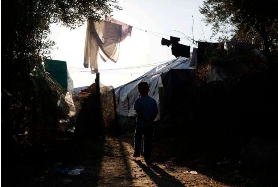
Child living in the "Olive Grove" adjacent to Moria camp, Lesvos, Greece – September 2019.