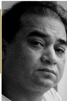
ILHAM TOHTI, CHINA

Sentenced to life imprisonment after an unfair trial for documenting interethnic violence