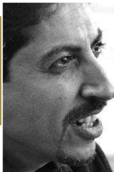
ABDULHADI AL-KHAWAJA, BAHRAIN

Sentenced to life imprisonment for defending the political and cultural rights of the Uyghur people