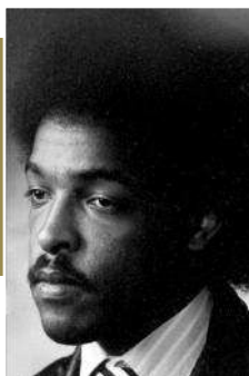
DAWIT ISAAK, ERITREA

Sentenced to life imprisonment for demanding democracy and human rights in Bahrain